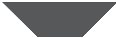
End caps (B)