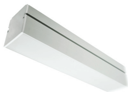
Light Line Extrusion

Extrusion available for recessing and suspending Feelux fittings.