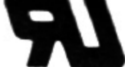
Table or floor dimmer